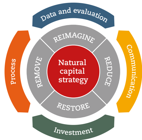
FIGURE 2: Natural capital strategy